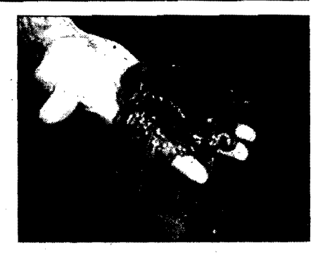
An example of rock snot, a non-native invasive species.

They will arrive via container ships and in shipping containers. They will be introduced to our lakes and streams via bait buckets, bilge water, live wells, boats, canoes, kayaks, trailers and fishing equipment. They will be spread.