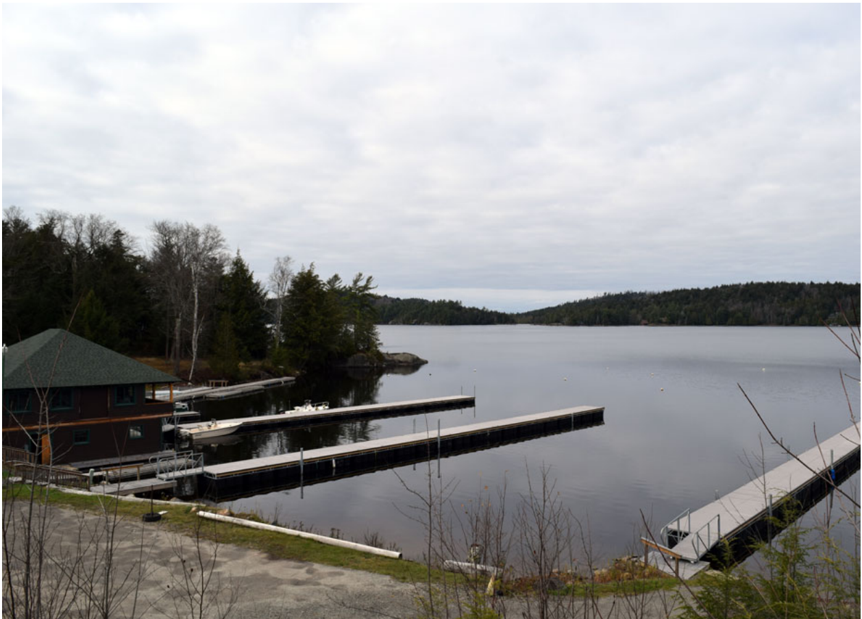
The Lower Saranac Marina on Crescent Bay is seen in November 2017.

SARANAC LAKE — Two members of ACME of Saranac LLC, a group fighting expansion of the Lower Saranac Marina, say a compromise on the projected size of the marina's expansion could end several years of litigation.