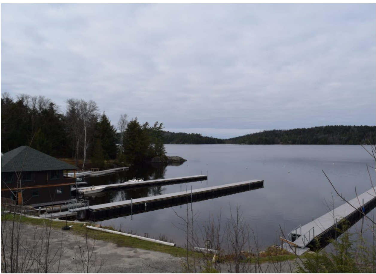
Crescent Bay Marina on Lower Saranac Lake is seen this week as developers discovered their purchase of the marina did not include the lake bottom itself, throwing a wrench into future plans.

SARANAC LAKE — Plans to expand the Crescent Bay Marina on Lower Saranac Lake hit a snag last week, when developers discovered their purchase of the marina didn't include a critical piece — the bottom of the lake, where the boat moorings are located. A quit-claim deed, dated Jan. 26, 2017, names Acme of Saranac, LLC, as the owner of 11 acres in Saranac Lake, much of which is directly in front of the marina. Although the marina