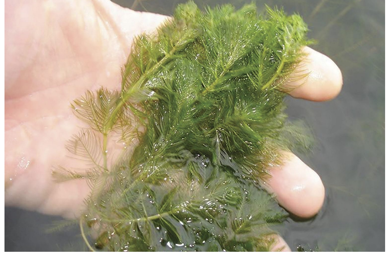
Invasive Eurasian watermilfoil.