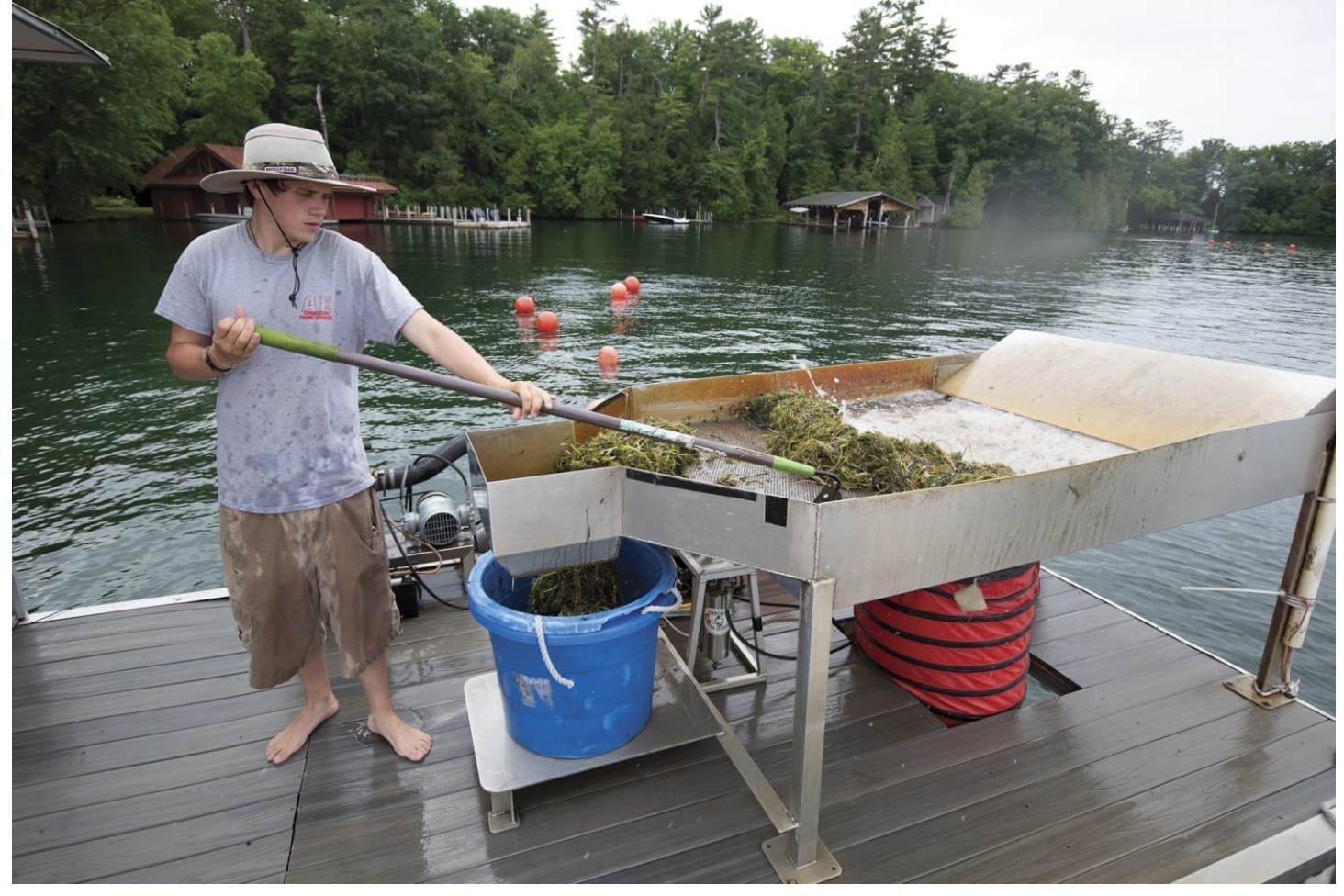
A worker collects watermilfoil on a boat on Lake George after it had been sent through a suction tube by a diver working on the lake bottom.

What is ProcellaCOR herbicide and how does it target milfoil?