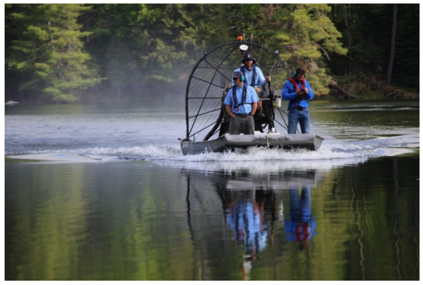
Consultants survey Minerva Lake before applying herbicide to combat Eurasian watermilfoil in June 2020.

Proponents of the herbicide ProcellaCOR say it's safe and effective. Skeptics warn the studies are limited and the long-term effects are still not well understood.