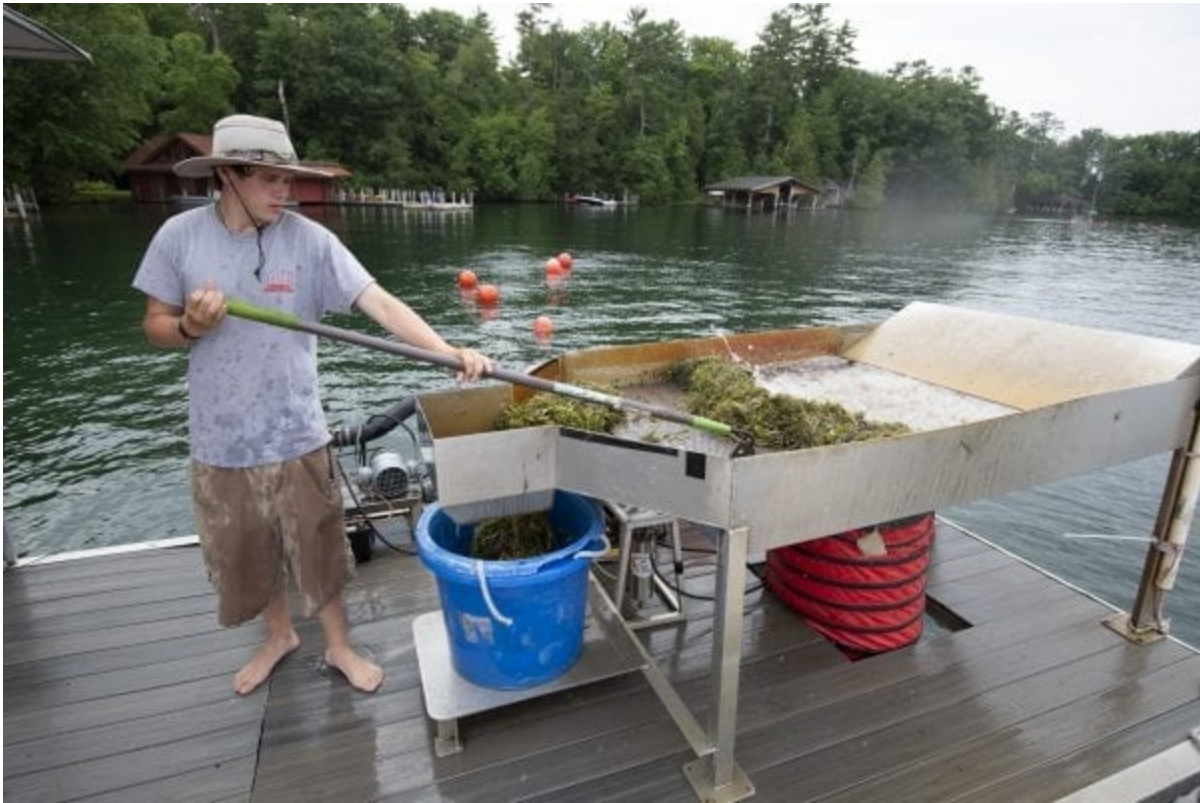
A member of A.E. Commercial Diving Services harvests milfoil in 2019 on Lake George.