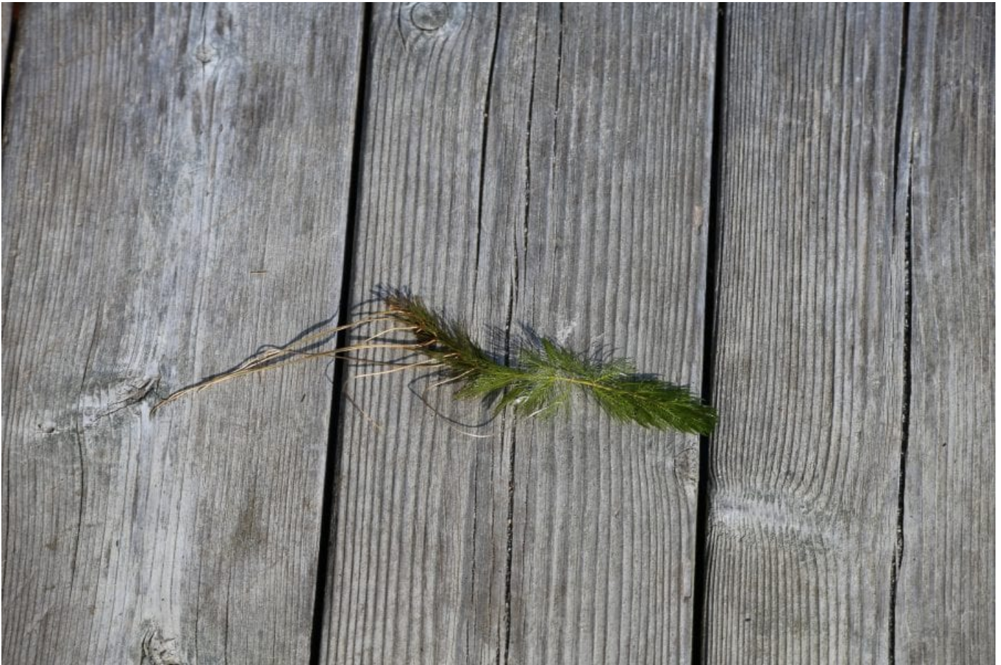
Eurasian watermilfoil.

The LGA's claim that ProcellaCOR will cause harm by spreading throughout the lake, the Park Commission said, does not consider the fact that the herbicide would become highly diluted in lake water. As for concerns about ProcellaCOR's suitability in the moving waters of the lake, the park commission emphasizes the pilot sites have been visited and approved by APA and DEC staff, as well as a member of SOLitude Lake Management.