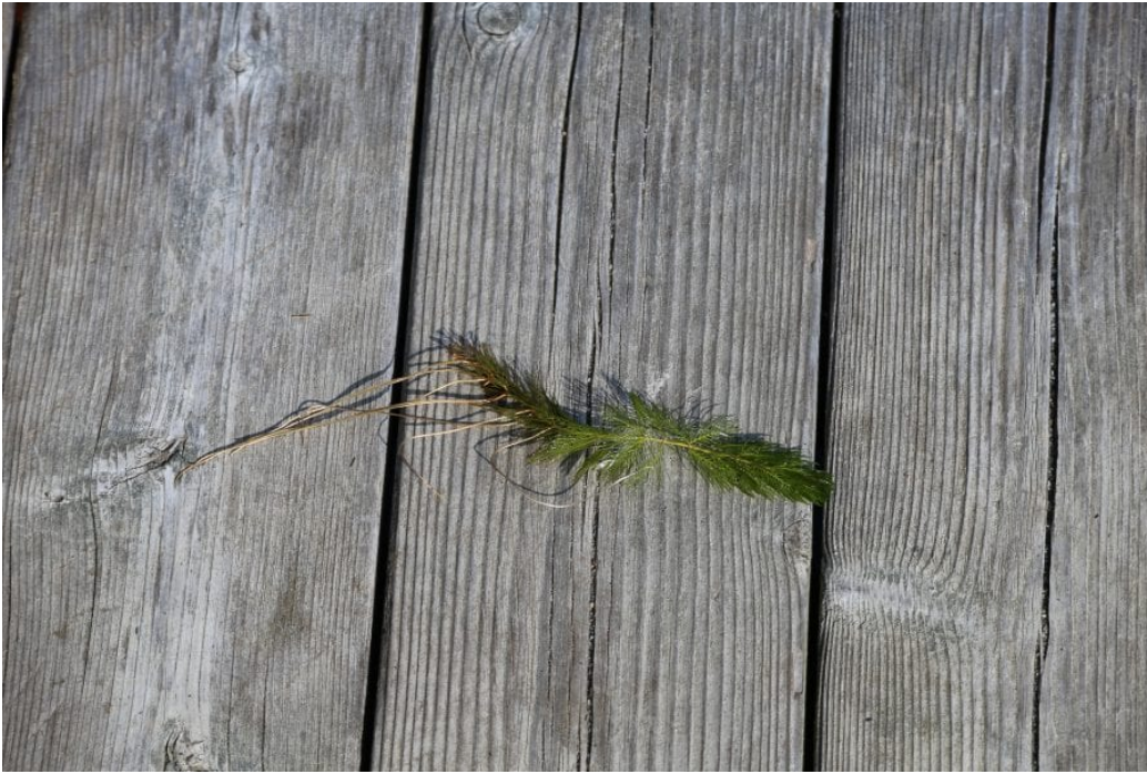
Eurasian watermilfoil forms dense mats, which block the sun and kill off native plants. They also grow so thick, boating and swimming can be impossible.

The town still plans to conduct milfoil surveying and harvesting if needed this year. Walrath said the APA will follow up with the town to see if the herbicide is still keeping the worst of the milfoil at bay. Overall, he said, the APA has determined that the herbicide did clear out Eurasian watermilfoil over the entire water body, though the weed is not considered eradicated. The APA did not find that the herbicide had