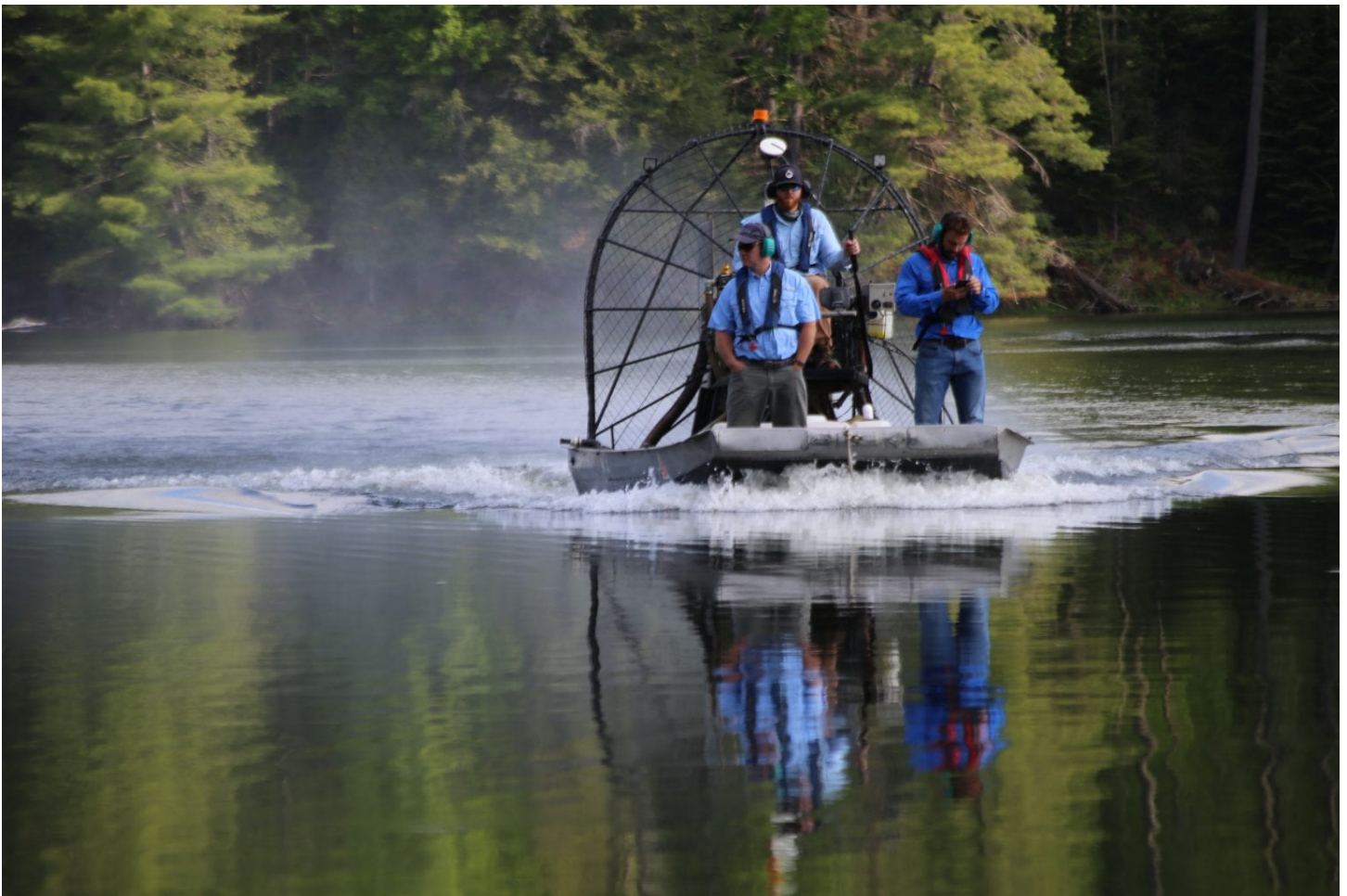
Consultants survey Minerva Lake before applying herbicide to combat Eurasian watermilfoil in June 2020.

Walrath said the treatment should last through 2022. The APA does not consider an invasive species eradicated unless a water body can go at least three years without any observations.