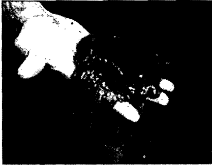
An example of rock snot, a non-native invasive species.

They will arrive via container ships and in shipping containers. They will be introduced to our lakes and streams via bait buckets, bilge water, live wells, boats, canoes, kayaks, trailers and fishing equipment. They will be spread