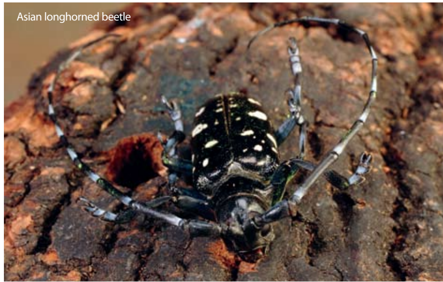
Asian longhorned beetle

Introducing new species is not a new concept. In fact, it has been going on for a long time. Native American tribes widely