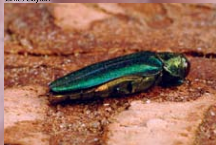
Top: zebra mussel, garlic mustard, Japanese knotweed Bottom: Chinese mitten crab, Asian longhorned beetle, emerald ash borer