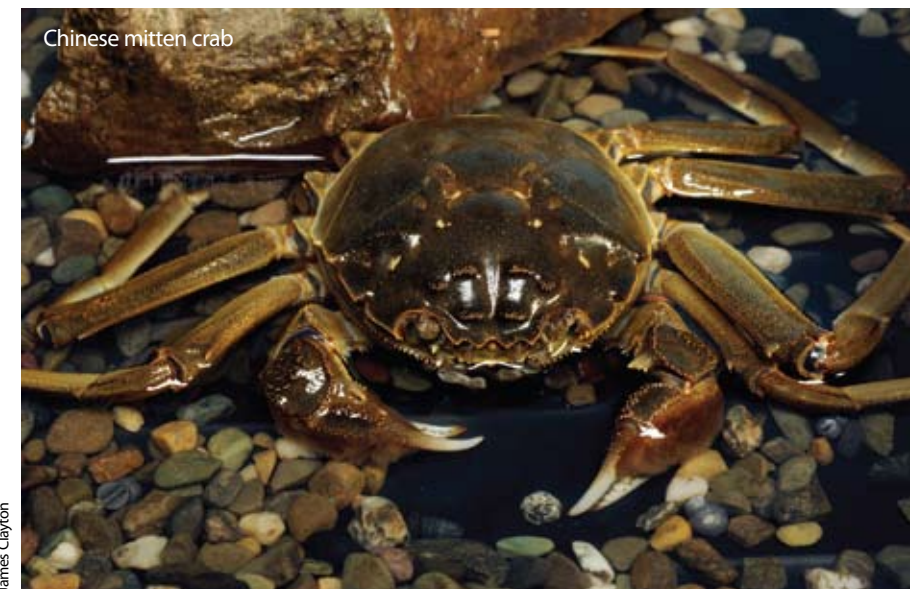
Chinese mitten crab

The Chinese mitten crab is another troublesome invasive, thought to have arrived here via ballast water, or possibly through the international live food trade. Mitten crabs are catadromous, reproducing in the ocean, with their young moving into freshwater tributaries where they remain upstream until adulthood. They burrow into stream banks, causing bank instability and collapse, resulting in lost habitat for native species. Mitten crabs compete with native crabs and other aquatic animals for food, and are able to move tremendous distances along stream bottoms. The first mitten