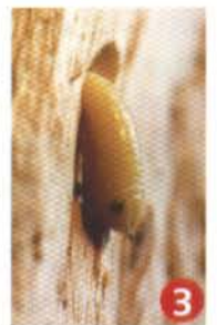
Detail of the characteristic back "horntail" spine

Because of the danger that sirex woodwasps pose to New York's pines, DEC is asking the public to report any sightings of the insect or its damage. Away from its native Europe, these wasps have no natural enemies and so could spread unchecked if not detected early enough. Signs of possible infestation in pines include dying needles in the tree crown, or sudden tree death for no obvious reason. If you suspect a tree may be infected, look on the tree trunk for exit holes, often marked by oozing resin. Woodwasp exit holes will be randomly scattered on the tree, in contrast to regular rows of holes made by sapsuckers. Also, keep an eye on any cut wood with tunnels throughout the wood. The presence of white larva with a distinctive back spine or "horntail" on the rear indicates a sirex woodwasp infestation.