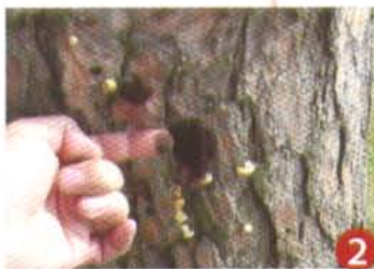
An example of an infected tree

Sirex woodwasps are solitary black wasps with brownish wings and orange legs. Females lay their eggs in pine tree trunks, where the eggs hatch into white, wood-boring grubs. The grubs then tunnel through the tree, eventually emerging as adults through holes measuring 1/4 to 3/8 inch in diameter. During the egg-laying process, female woodwasps also inject a toxin to weaken the