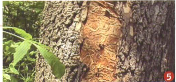
Damage created by an Emerald Ash Borer

Affected ash first show dieback in the crown, and may have cracks in the bark overactive feeding tunnels. As the inner bark is destroyed, the tree dies back and may grow sprouts from the middle or the base of the trunk. Called epicormic sprouting, this is a last-ditch effort for survival by a mortally stressed tree. If you spot these symptoms, look closely at the tree